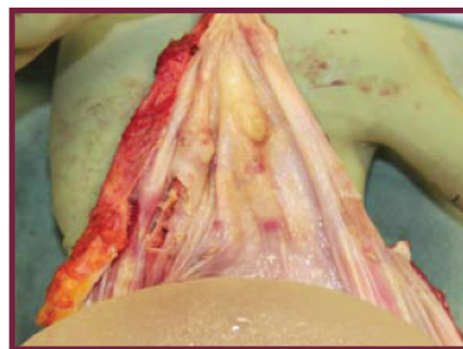
Figure 1. Example of BI-ALCL presentation with right breast swelling. Capsule appearance of BI-ALCL mass.

This joint statement was prepared by ASPS and ASAPS.