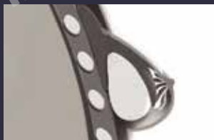
Submuscular Implant Placement